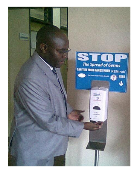
No touch, safer & hygienic

With advanced technology and humanized design, the DoctorClean® DT800 series touch free dispensing system makes it easier and more hygienic for you to get your hands clean and stay healthy.